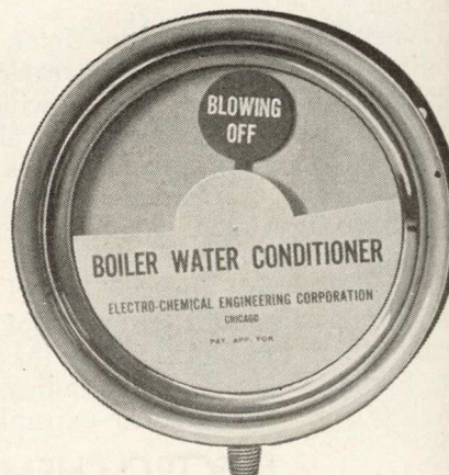
Fig. 587—(Right) Blowing-Off Indicating Gage.

Electro-Chemical Engineering Corporation Subsidiary of Dearborn Chemical Company